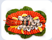
Andrew's Special Platter