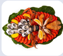
Exotic Seafood Platter